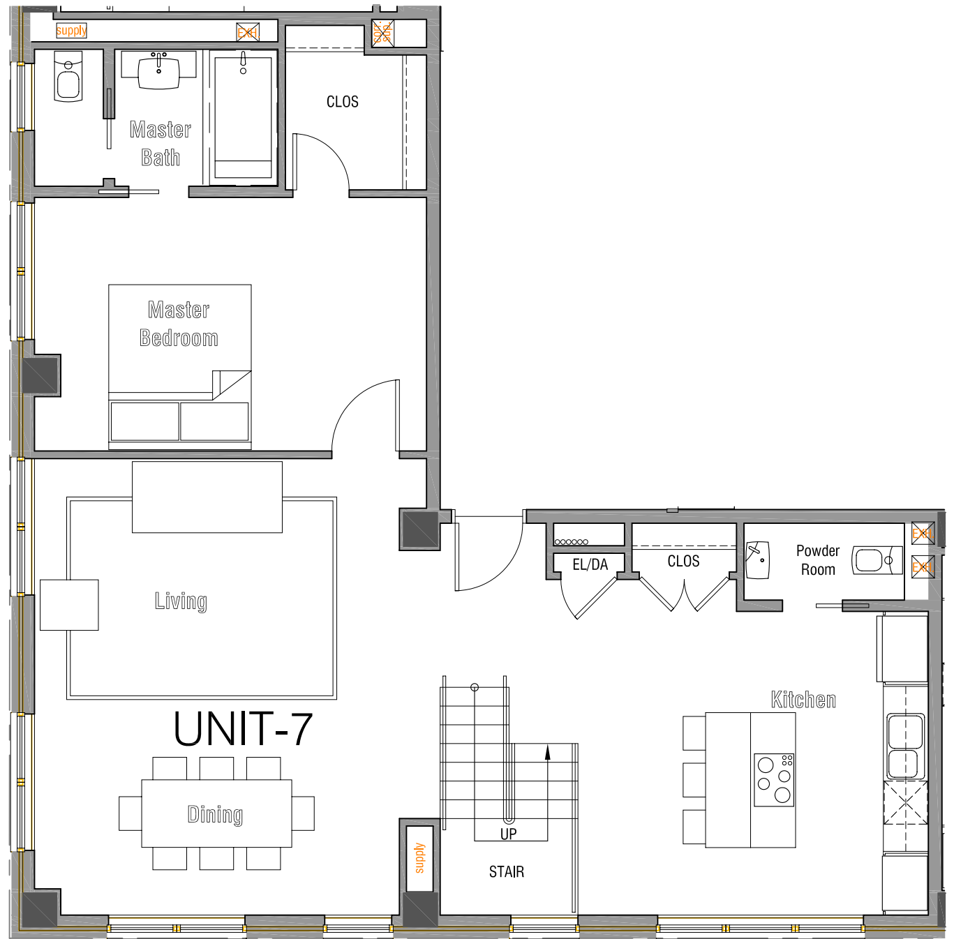
CONDO UNIT #7 - 2nd, 4th, 6th Floors